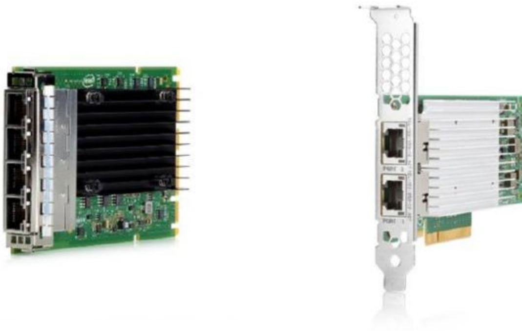
HPE Gen10 Plus Ethernet Adapters

With Gen10 Plus ProLiant Servers, HPE is offering the industry's most secure server platform. Through its Root of Trust server design down to the Network Interface Card (NIC), these security features are built-in so you can deploy with confidence. HPE Gen10 Plus servers will help prevent, detect and recover from cyberattacks such as denial of service and malware-infected firmware. Protecting applications, data and infrastructure from security breaches through storage and networking security technologies is first priority for HPE Gen10 Plus Servers.